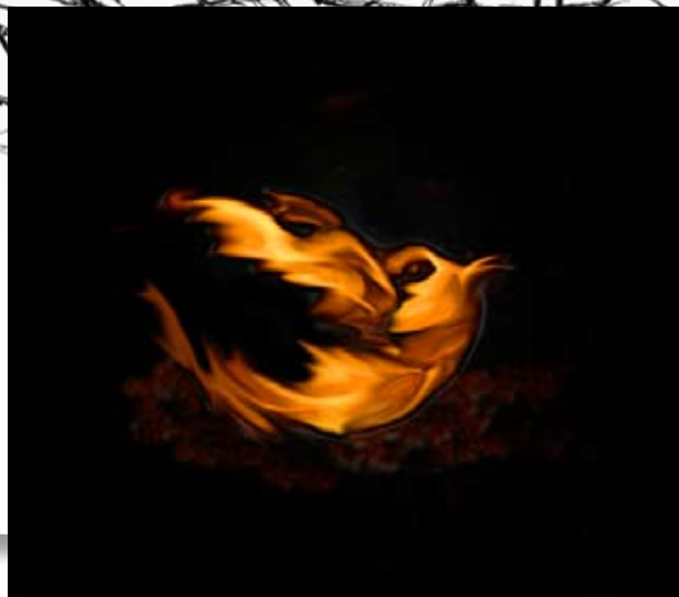
SCOTT HARTSHORNE, 'A Study in Opposites', charcoal on acid-free paper, 70 x 50 cm